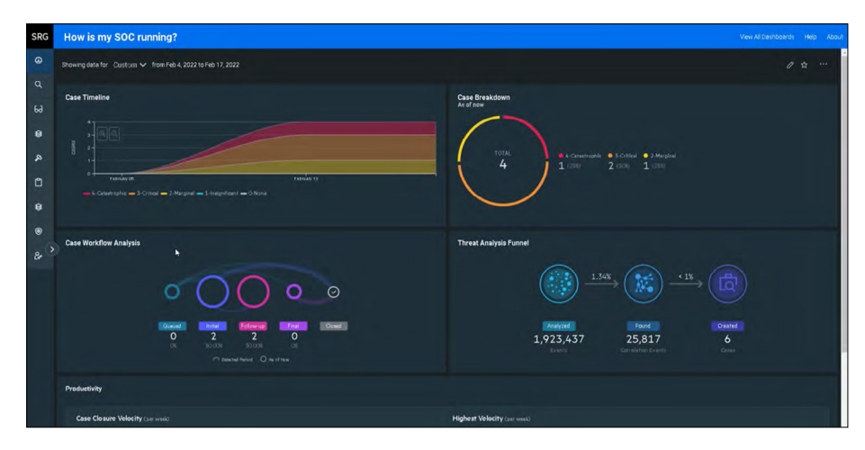
SOC metrics dashboard

OpenText Enterprise Security Manager enables real-time threat detection through the power of extensive data connectivity, robust data processing and enrichment, proven real-time correlation, rich content, solid MITRE ATT&CK framework support, and native SOAR to improve security operations efficiency and help analysts do more in less time, with less stress.