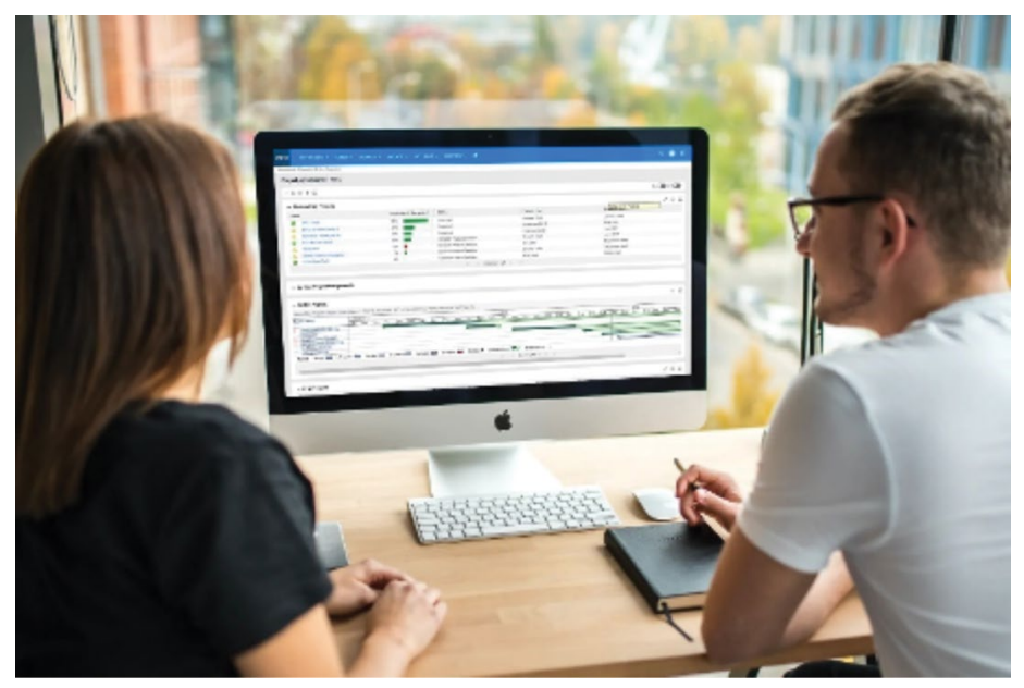
Figure 3. Track all your projects and record progress in one place.

As tasks are assigned to resources, they automatically appear on each user's dashboard. As users update their status, information is automatically rolled up through the project hierarchy so that project managers and stakeholders see current project status in real time, anytime. Project Management also facilitates managing by exception. Color indicators identify project health by cost and schedule so you can easily identify problems. The Project Overview page becomes the "one-stop shop" for managing and assessing the health of the project, with details just a click away.