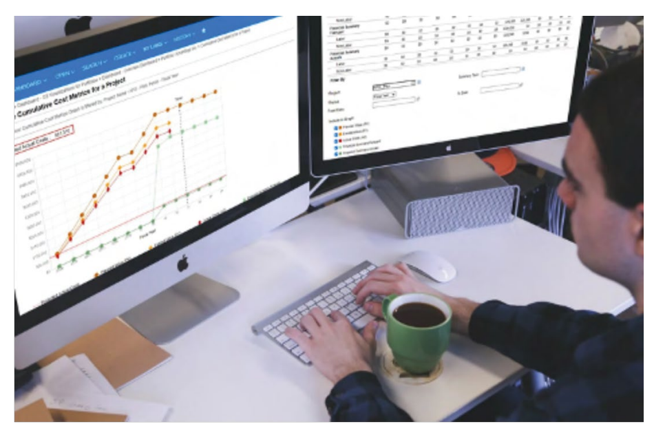
Figure 6. Track planned and actual costs across multiple projects, programs, and portfolios.

One of the keys to governing financial controls effectively across your portfolio is ready access to the budgeted plan of record and actual/forecasted costs. Financial trending and comparisons are available with OpenText Project and Porftolio Management software point-in-time snapshots of the financial summary information. This gives you the requisite real-time visibility needed to analyze approved spend and forecasted costs, and quickly determine if a whole portfolio or programs and projects are at risk of going over budget.