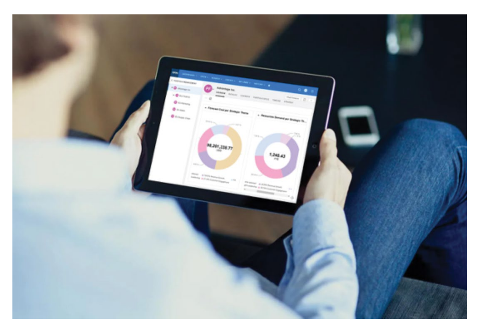
Figure 5. Real-time views: The Portfolio Management dashboard displays portfolio management information, giving your IT and business leaders realtime views of portfolio performance to support dynamic decision-making.