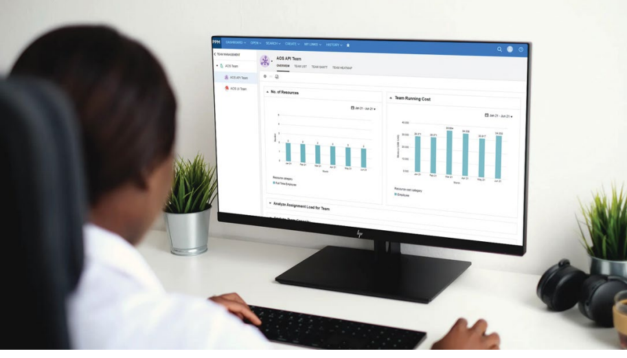
Figure 8. The Team Overview page lets you track team-level metrics with powerful data portals.

OpenText Project and Porftolio Management is offered as a Software as a Service (SaaS) or an in-house project and portfolio management solution. You benefit from the flexibility to jump-start your implementation using our SaaS solution and migrate in-house when and if you choose to. Plus, OpenText best practices are provided whether you opt for our SaaS solution for faster time-to-value and lower total cost of ownership (TCO) or for an in-house implementation backed by an expert team of consultants.