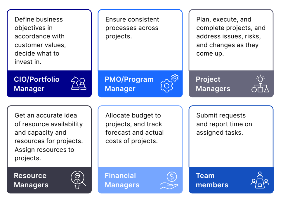
Figure 1. Different people in your organization will use OpenText Project and Portfolio Mangement to achieve common goals.