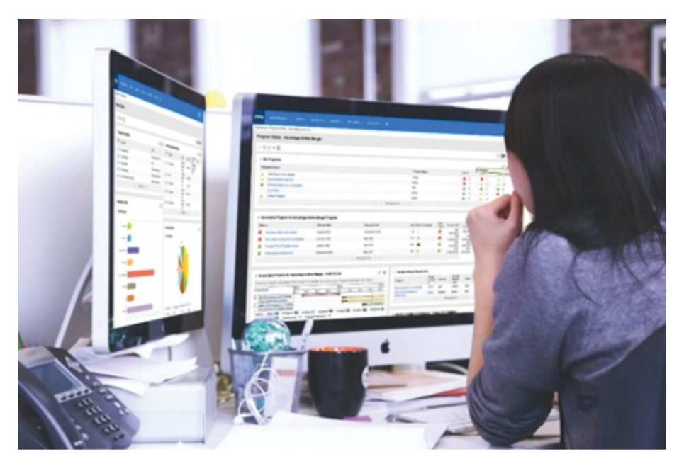
Figure 4. Best-practice PMO processes let you model and enforce corporate PMO standards while keeping your stakeholders and team members aligned at every step.

The Program Management module is an excellent way to optimize the value your PMO delivers to your business while reducing risk. From large programs to individual projects and tasks across your portfolio, Program Management improves your PMO governance and execution.